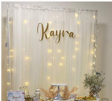
White Organza Curtain and FairyLight