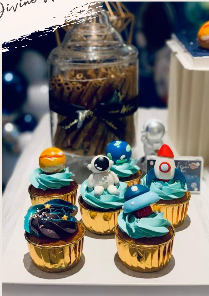
Hand-crafted Theme Cookies