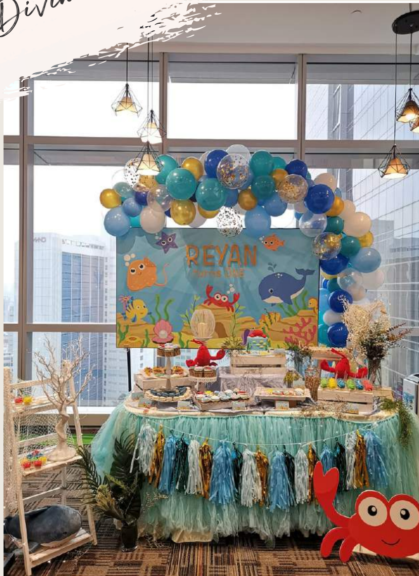
Under the Sea Theme