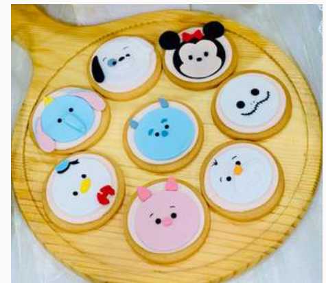
Customized Fondant Cupcakes