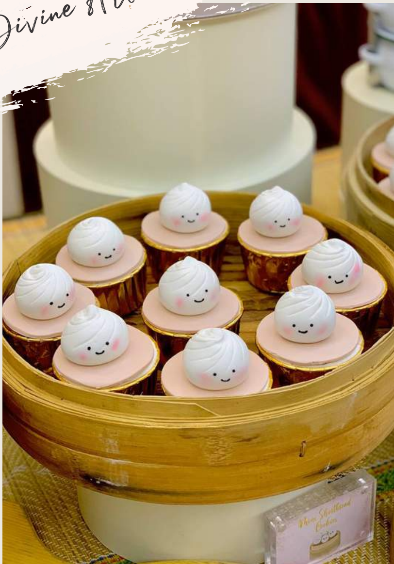
Hand-crafted Theme Cupcakes