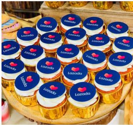
Customized Edible Icing Toppers